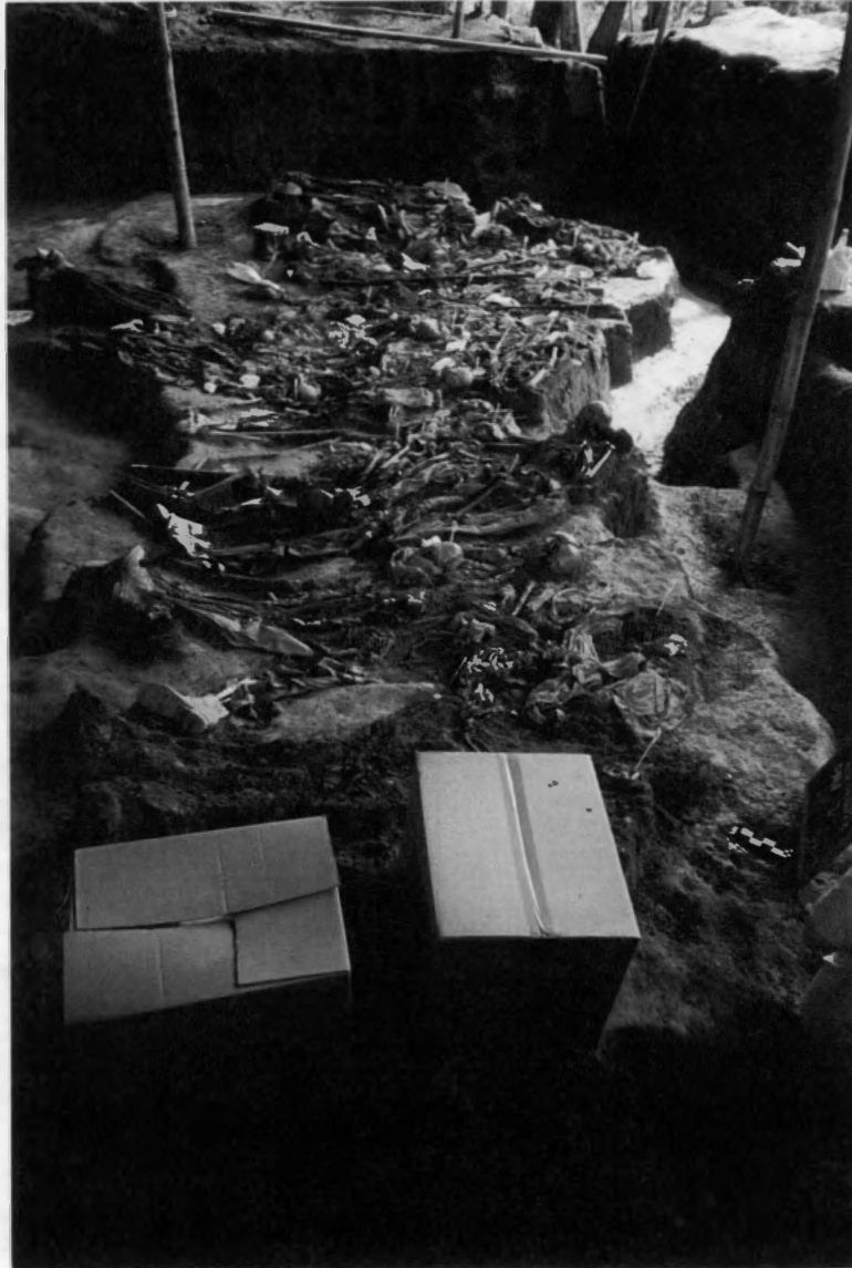
Figure 4-7 Remains boxed for transport to a lab facility after exhumation from a mass grave in Panzós, Guatemala 1997