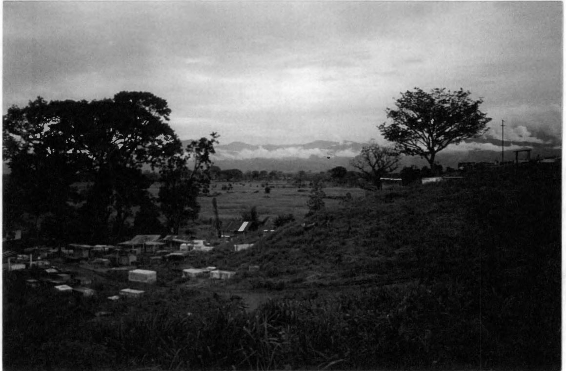
Figure 4-1 Location of a mass grave being excavated in Panzós, Guatemala 1997