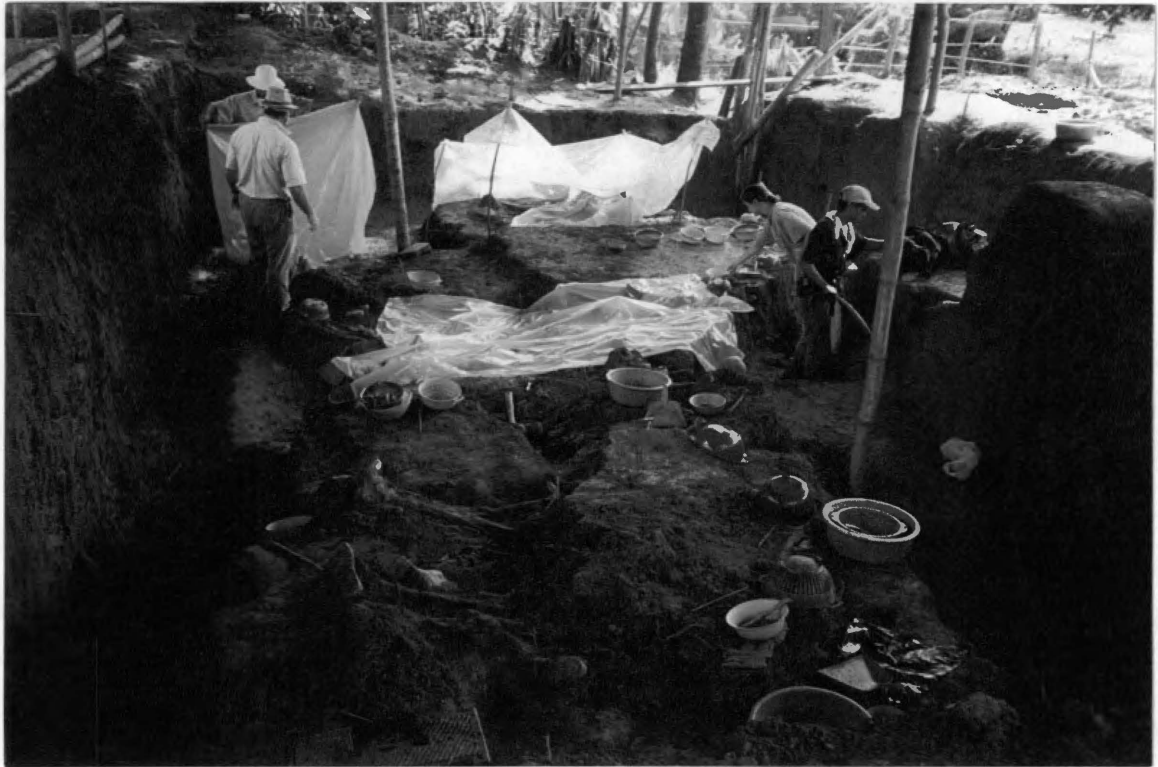
Figure 4-5 Exposed remains covered after partially completing the excavation of a mass grave in Panzós, Guatemala 1997