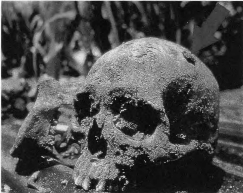
Figure 4-8 Typical pattern of wounds suffered by individuals found in a mass grave in Chontalá, Guatemala from A Mayan Struggle , by Vincent Heptig. Copyright 1997.