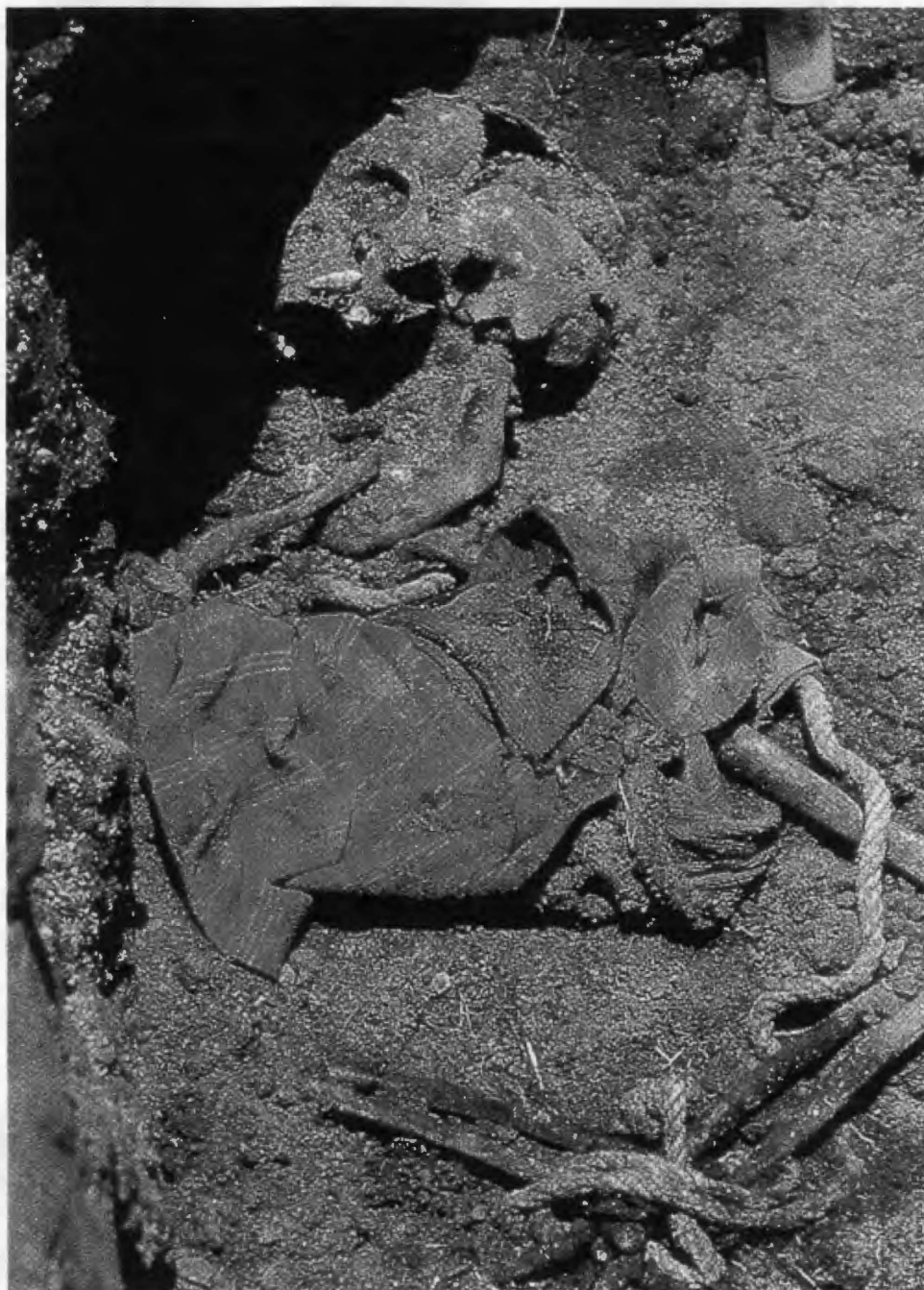
Figure 4-9 Evidence of torture from a mass grave in Chontalá, Guatemala 1991 from A Mayan Struggle , by Vincent Heptig. Copyright 1997.