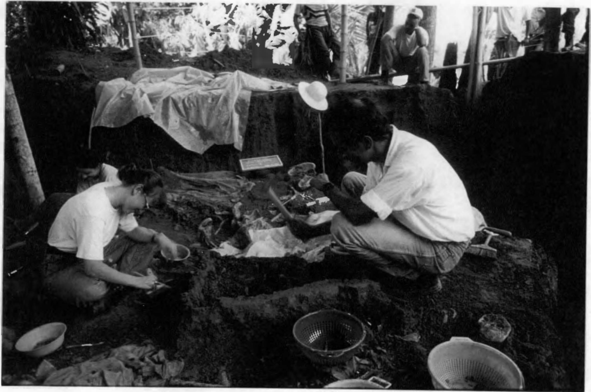
Figure 4-4 Excavation process in Panzós, Guatemala 1997