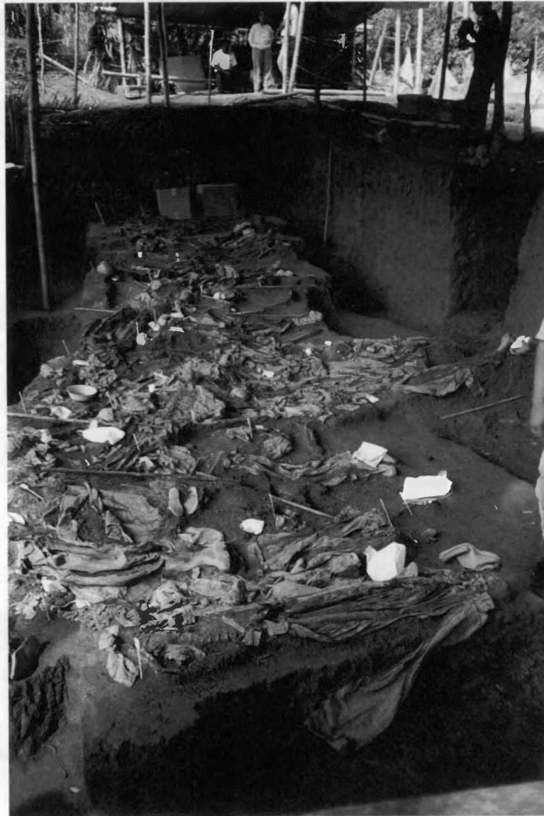
Figure 4-6 Completed excavation of a mass grave containing 35 bodies in Panzós, Guatemala 1997