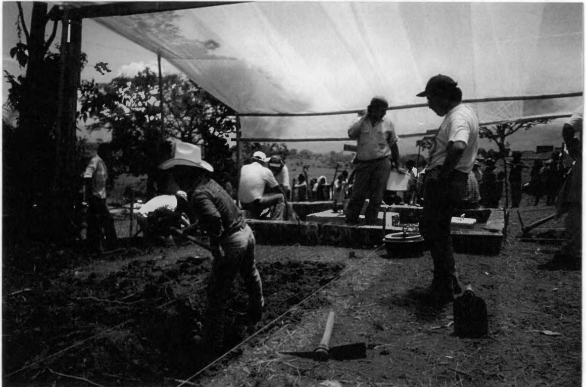
Figure 4-3 Local volunteers assisting the Guatemalan Forensic Anthropology Foundation in the exhumation of a mass grave in Panzós, Guatemala 1997