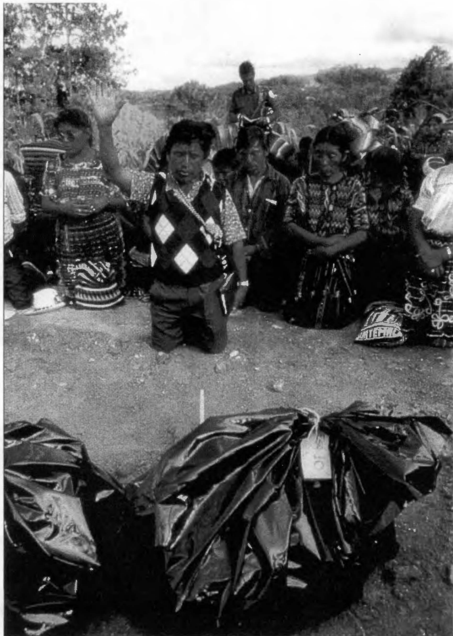
Figure 4-2 Community ceremony before the removal of remains exhumed by the Argentine Forensic Anthropology Team from a mass grave in Chontalá, Guatemala 1991 from A Mayan Struggle , by Vincent Heptig. Copyright 1997.